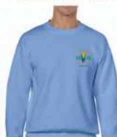
Carolina Blue Crewneck Sweatshirt