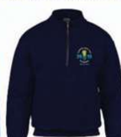
Navy Blue 1/4 Zip Collar Sweatshirt