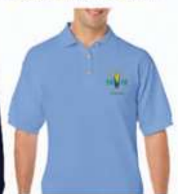
Carolina Blue Pique Sport Shirt