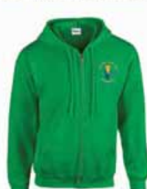
Irish Green Full zip Hooded Sweatshirt