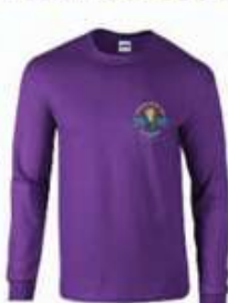
Purple Long Sleeve T-Shirt