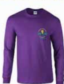
Purple Long Sleeve T-Shirt