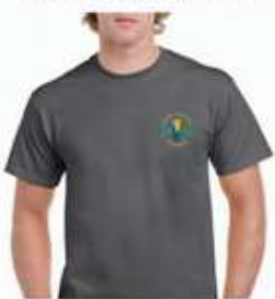
Dark Heather Tee Shirt