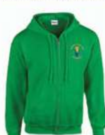
Irish Green Full zip Hooded Sweatshirt