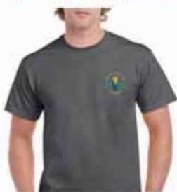
Dark Heather Tee Shirt