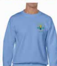
Carolina Blue Crewneck Sweatshirt