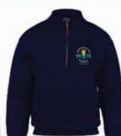
Navy Blue 1/4 Zip Collar Sweatshirt