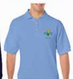
Carolina Blue Pique Sport Shirt